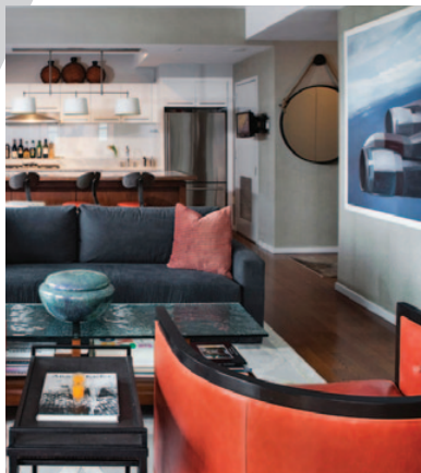
SOFA'S CHOICE A charcoal gray sofa anchors the living room, and bright orange, leather-upholstered club chairs provide a splash of color.

"THE CLIENTS HAVE WONDERFUL TASTE AND A BEAUTIFUL COLLECTION OF ART, BUT THE FLOOD WAS A CHANCE TO RETHINK THE FLOOR PLAN, COLORS AND TEXTURES OF THE APARTMENT."